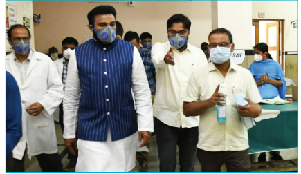
Hon'ble Minister for Health & Family Welfare Shri B. Sriramulu visiting COVID-19 Government Hospital

Doctors registered under KPME Act are already uploading the ILI/SARI/COVID-19 suspect patients data in the KPME website on a daily basis.