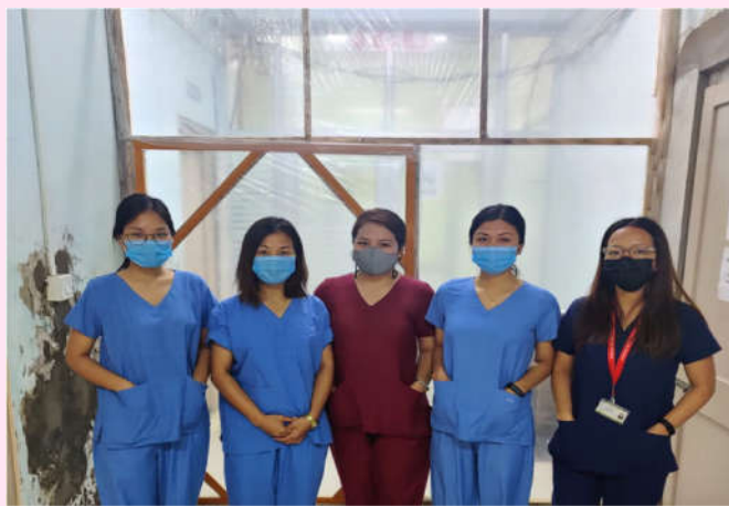
ICU Duty te