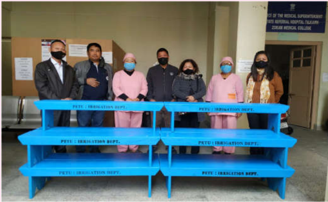
Chief Engineer & Staff, Irrigation and Water Resources Department ten Hospitala hman turin Bench 10 (sawm) lai min rawn pe a, an chungah kan lawm hle a ni.