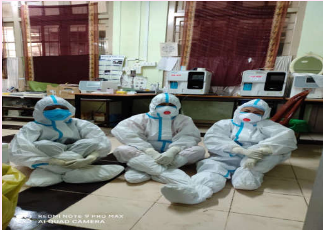
ZMC/SRHF Covid-19 Laboratory Duty te