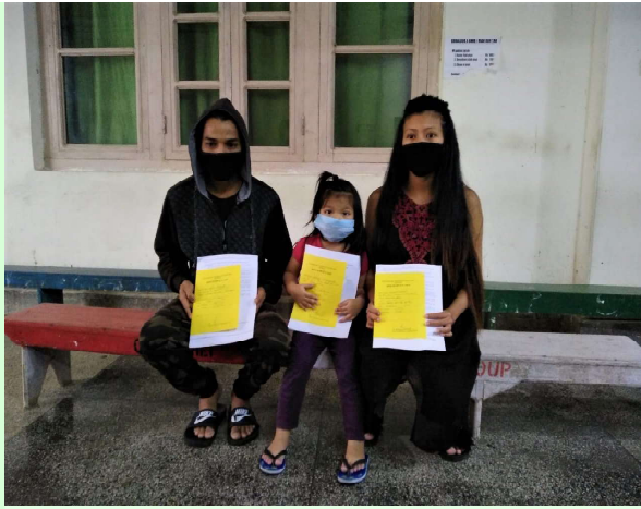
Wawiin khan ZMC-a Covid 19 damlo enkawl dam tawh mi 3-te chu discharged fel an ni a, chhungkua niin an fanu hi kum 3 mi a ni.