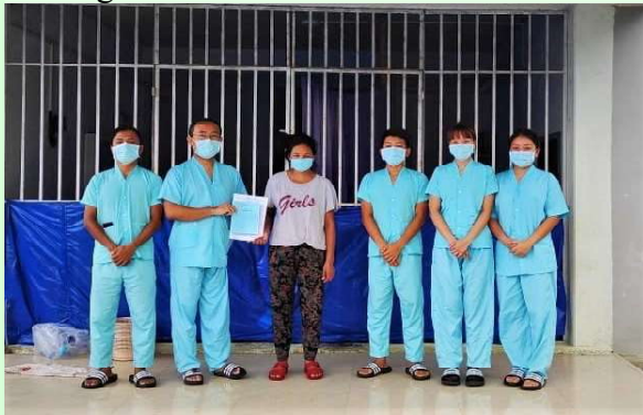
Mamit DCHC atangin wawiin khan Covid 19 damlo enkawl dam tawh mi 1 discharged a ni