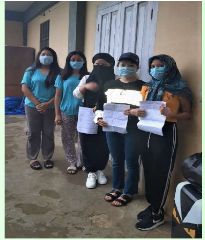
Wawiin khan Mamit CCC atangin Covid 19 damlo enkawl dam tawh mi 3 discharged an ni. Tun dinhmunah Mamit District-ah Covid 19 damlo enkawl mek an awm tawh lo a ni.