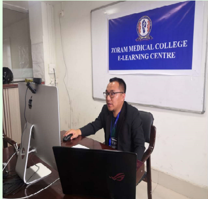
Online Class @ ICT

COVID 19 AMBULANCE Covid 19 lanchhuahna heng - Khawsik, Khuhro, Thawk lama harsatna nei, inentir duh, kalna nei silo Ambulance mamawh tan a hnuai number-ah hian biak theih a ni.