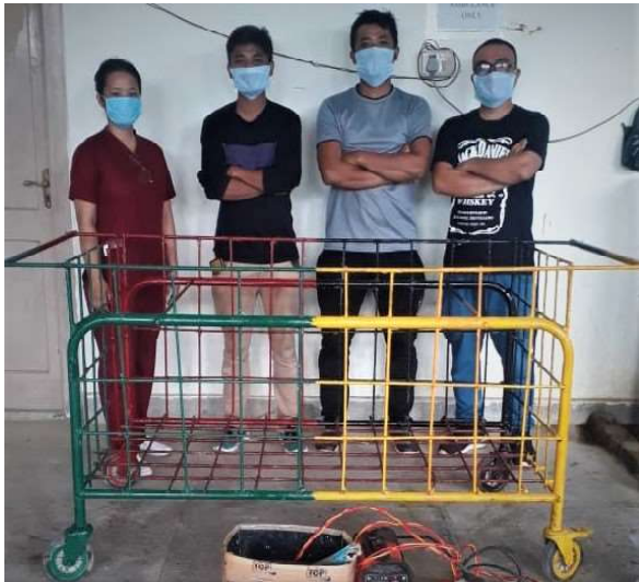
Biomedical Waste Trolley, ZMC-SRHF staff-te kutchhuak ngei.