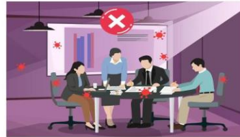
CONFINED OR ENCLOSED SPACES