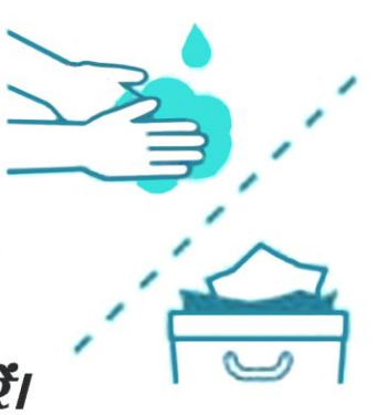
इस्तेमाल के बाद व्यर्थ सामग्री को कूड़ेदान में डार्ले और हार्थों को अच्छी तरह साफ करें।