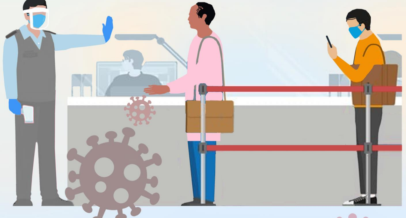
क्यों कि खतरा अभी टला नहीं है ..