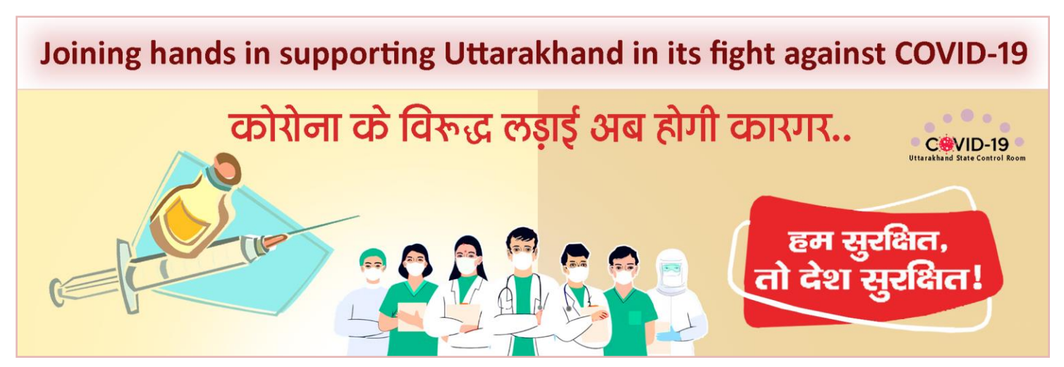
COVID-19 can register on the link given below:

https://health.uk.gov.in/pages/view/149-support-uttarakhands-covid-19-efforts